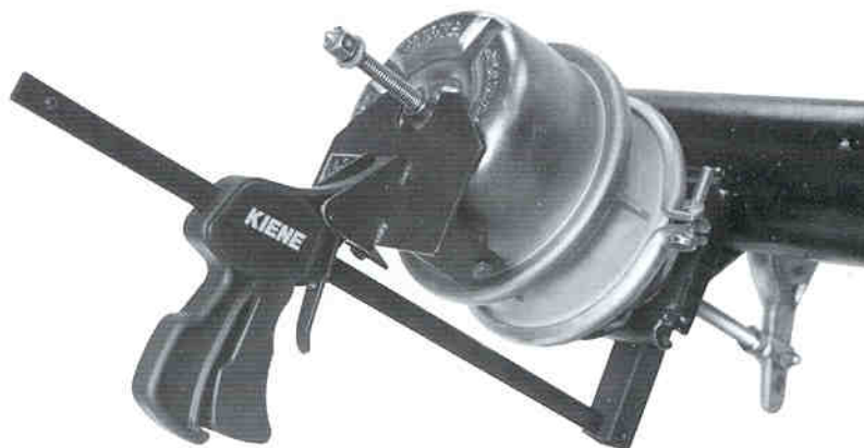
The 3 rd Hand Required to Replace an Emergency Section and Diaphragm Is Now Available From KIENE